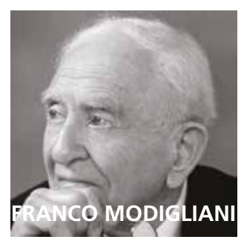
1985 Nobel Prize for Economics; graduated in Law in 1939