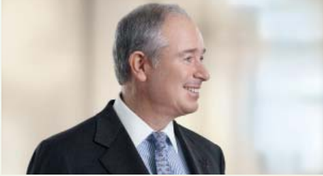
STEPHEN A. SCHWARZMAN CHAIRMAN, CEO AND CO-FOUNDER OF BLACKSTONE