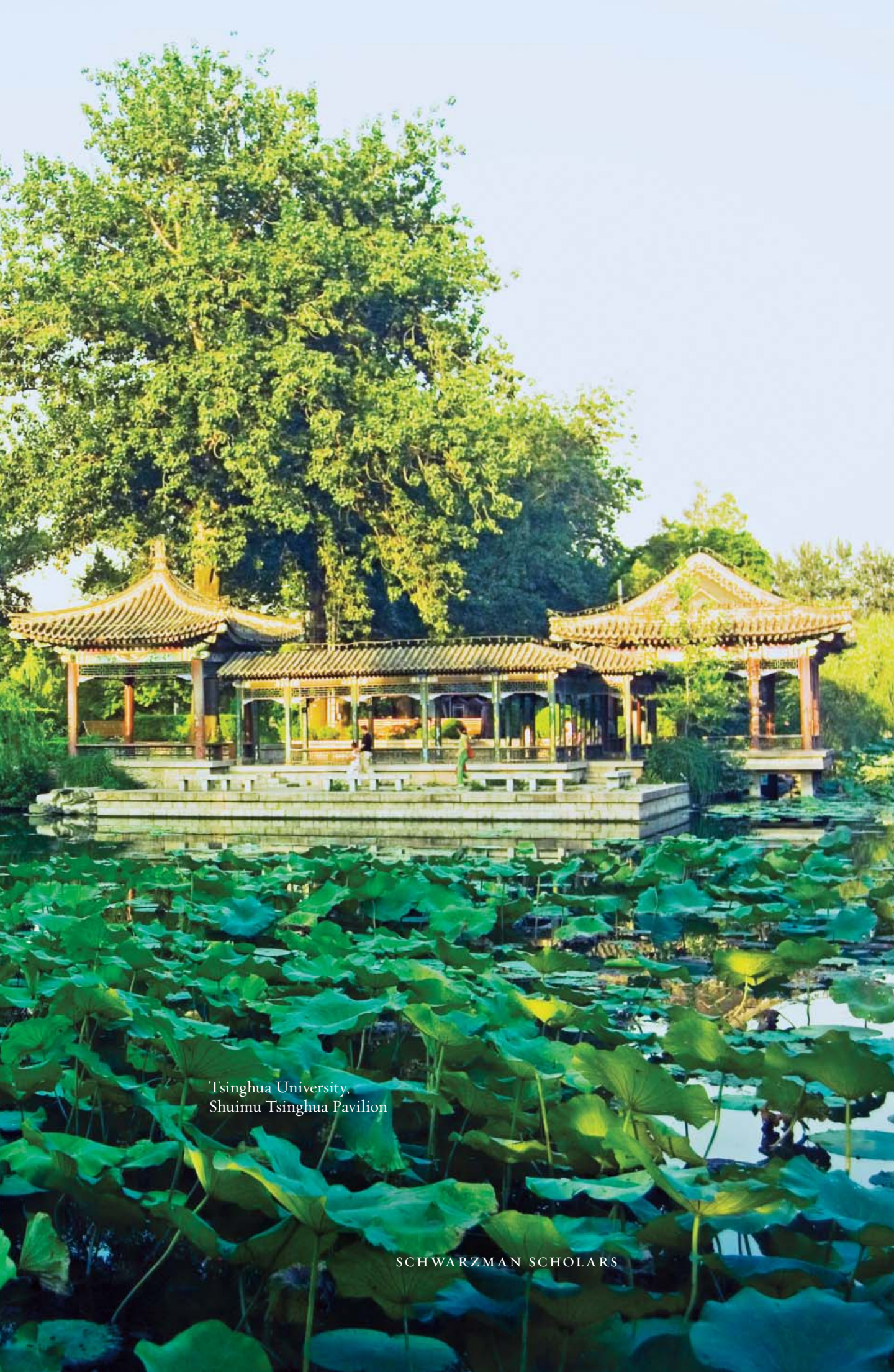
Tsinghua University, Shuimu Tsinghua Pavilion