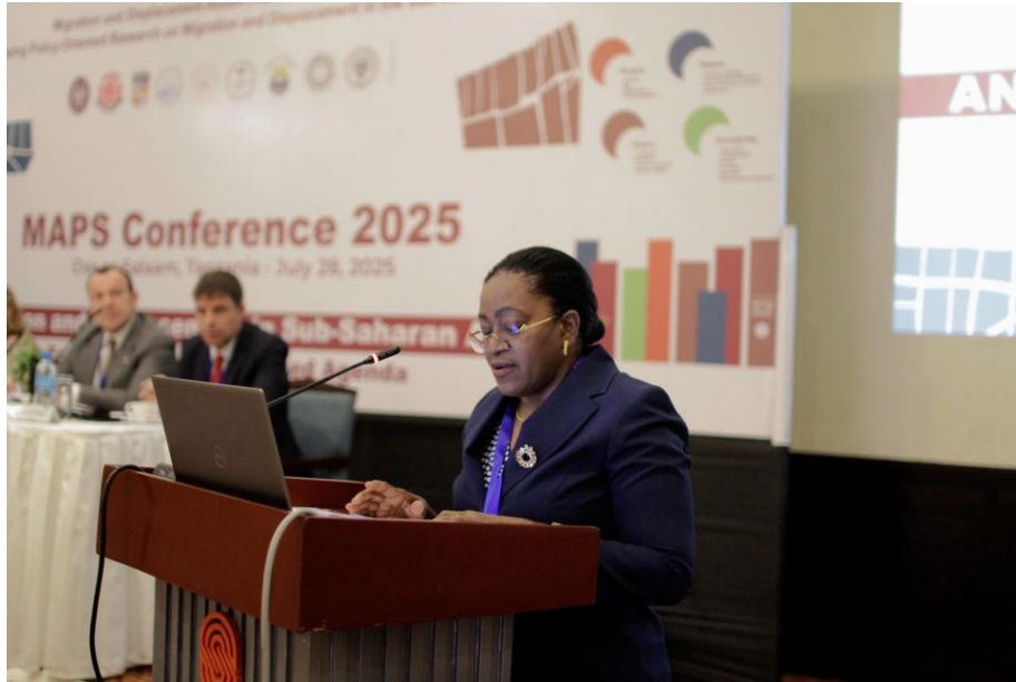
Anna Peter Makakala (Commissioner General of Immigration Ministry of Internal Affairs Tanzania)