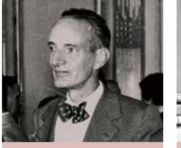
1957 Nobel Prize for Medicine, taught Psychobiology