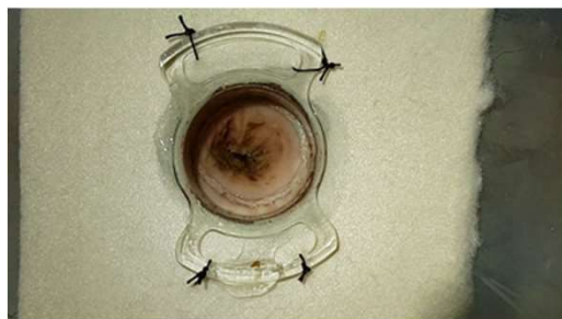
Fig. 5 Procedure outcome check.

The device consists of a transparent plexiglass box (L38 H19 D 26.5 cm) inside which is placed a tube of rigid plastic material (diameter 4 cm, length 26 cm), on which the anatomical preparation (porcine rectum) or an alternative synthetic tissue (silicone, polyurethane or combination) is housed and fixed simulating realistically the anatomy of the anal canal. On the front face, around the orifice of the metal tube, there is a cover of Velcro fabric, fixed with adhesive, which provides the substrate for the anchor points of the anal retractor of the circular stapler