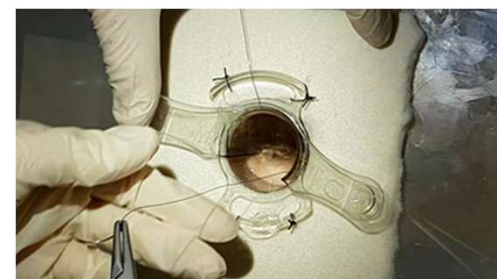
Fig. 3 Purse-string suture fashioning

The Anal Trainer is a prototype of a low budget portable surgical simulator which allows to the learner to gain a pre-clinical experience with the proctological surgical techniques required for a correct and safe execution of the trans-anal mucoprolapsectomy, this technique needs the fashioning of a purse-string suture and the use of a circular mechanical stapler. The simulator also allows the placement of hemostatic stitches and the fashioning of handmade trans-anal anastomoses, reproducing the anatomical conditions encountered in the endoluminal anal surgery