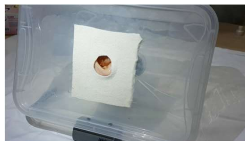
Fig. 2 Trainer assembled